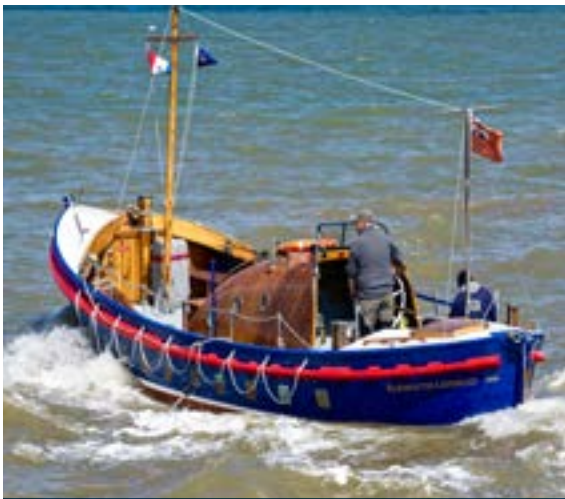
The Chieftain free after lockdown, by David Stearne.

An 'At Risk' assessment was undertaken of the NHF based on a survey of vessel owners and series of vessel visits, with a traffic light system introduced to highlight and monitor the risk rating of individual craft. Related guidance was published, outlining the help NHS-UK can provide in at-risk situations, the best approach to adopt and what process to follow. The publications Recording Historic Vessels and Deconstructing Historic Vessels were improved for accessibility and readability purposes, with changes aimed at the visually impaired who use screen readers.