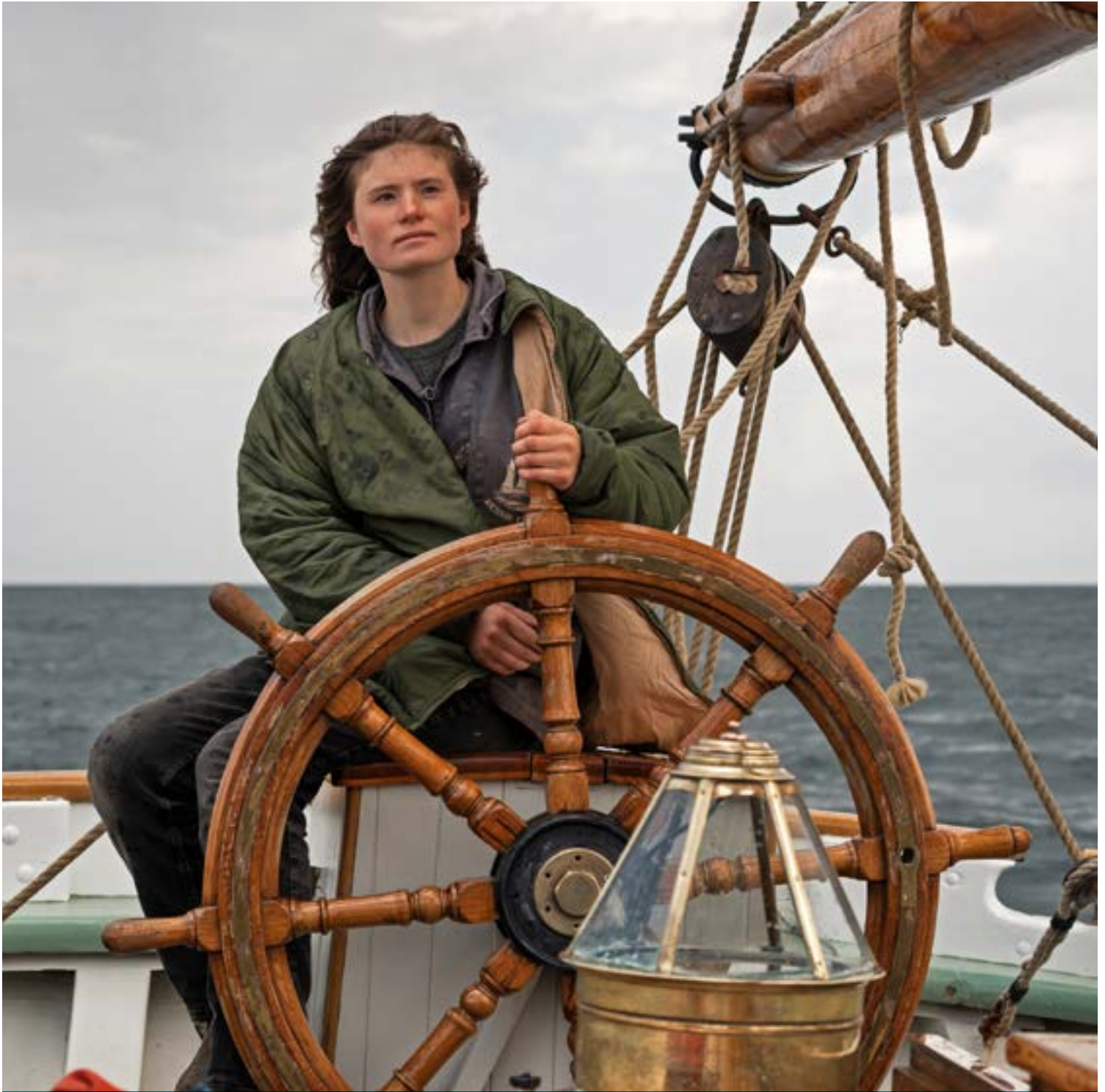
Watching the wind on Bessie Ellen , by Del Hogg.