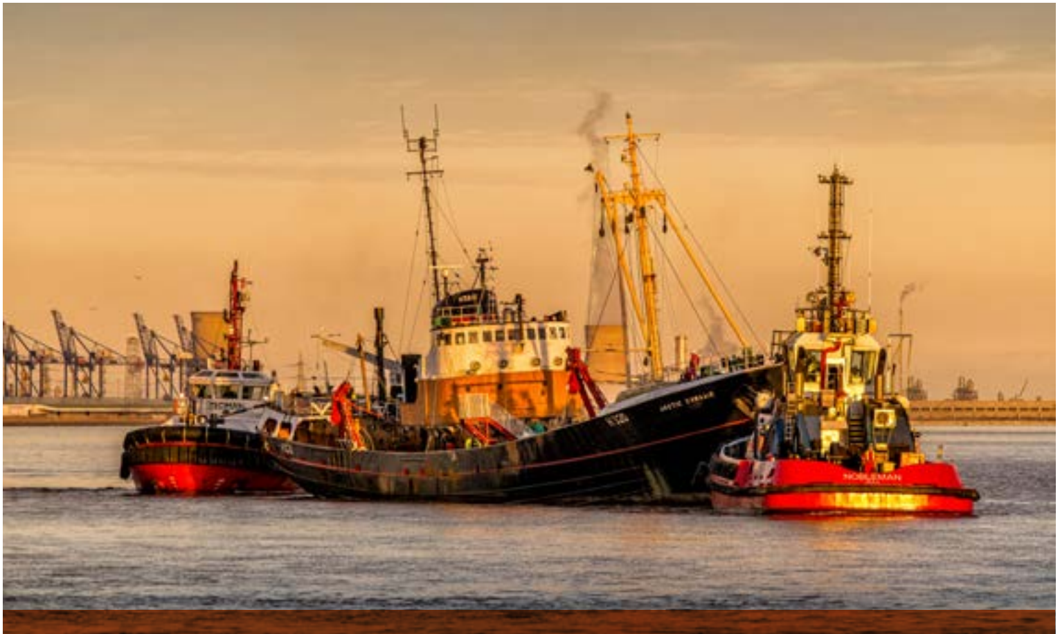
Journey to the big refit

Two online forums were created to support lug-rigged craft and museum ships, and a research internship hosted via the University of Oxford examined social and economic impacts for the latter. The National Heritage Memorial Fund commissioned a detailed piece of research into the NHF in collaboration with NHS-UK and ongoing support was given with stakeholder surveys and interviews.