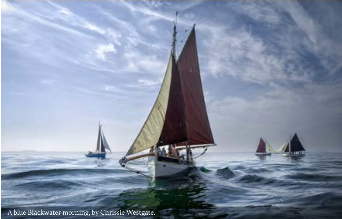
A blue Blackwater morning, by Chrissie Westgate.