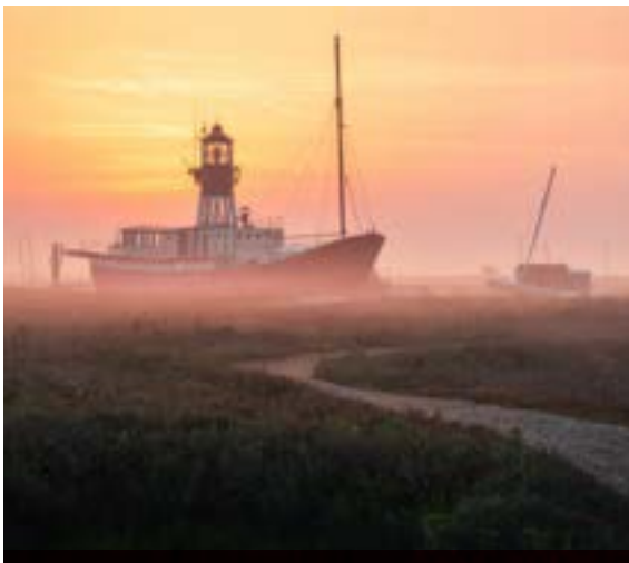
Trinity lighthouse boat at sunrise, by Dan Brand.