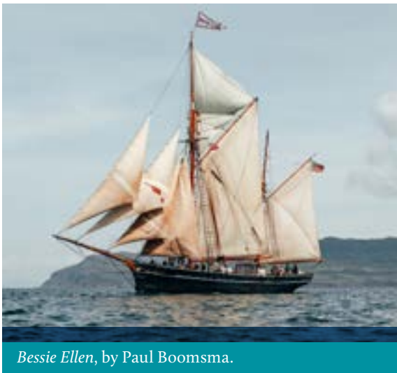
Bessie Ellen