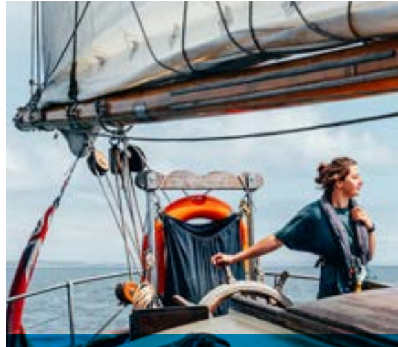
Sailing on Maybe

Thanks to a grant from the Philip Nicholas Charitable Trust of £13,670, the Shipshape Network web pages were upgraded, involving the improved design and layout of 80 project pages, 16 zone and hub pages and a new streamlined search function for the Skills & Services Directory. A photographic exhibition showcasing the 2022 winners was opened by the Deputy Mayor of Medway at the Historic Dockyard Chatham, with sponsors and guests enjoying a short trip