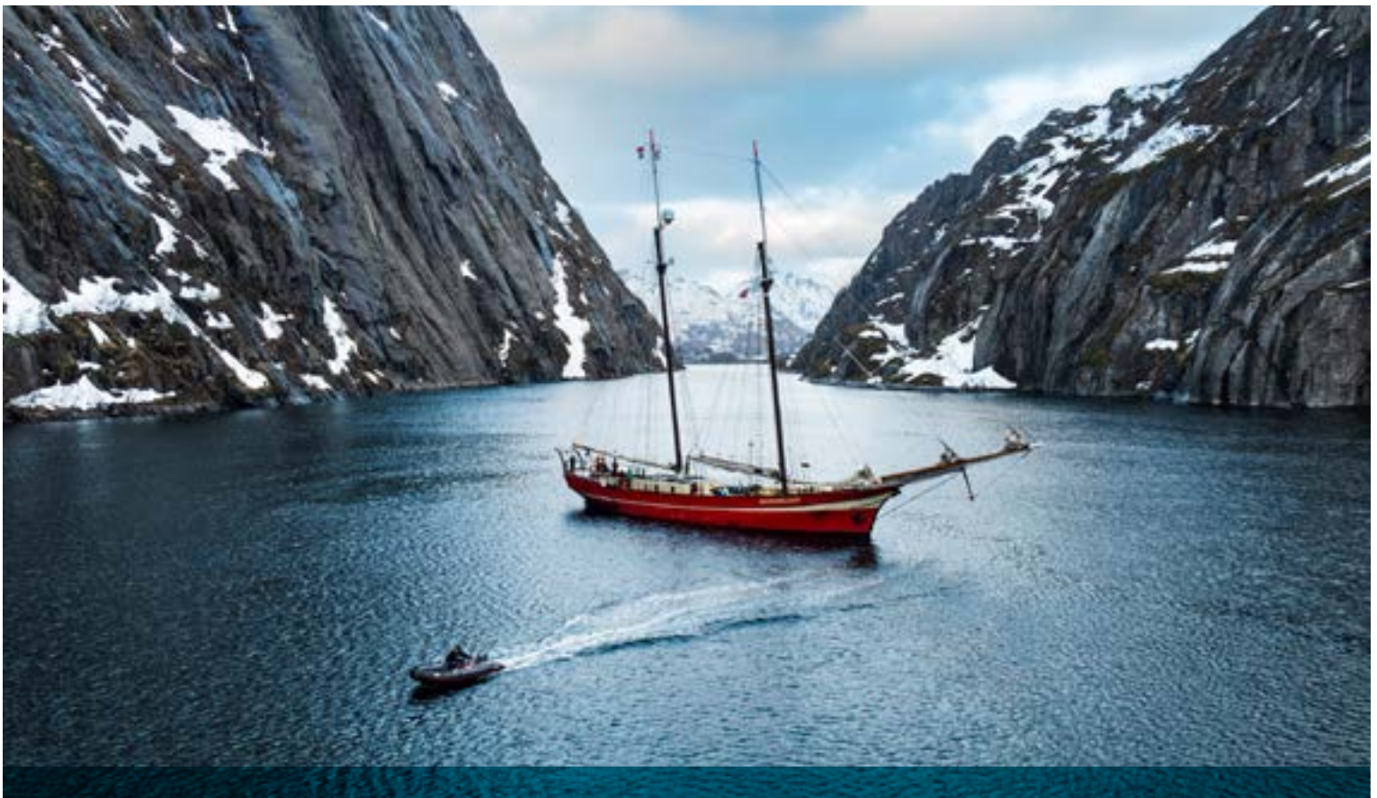
Between the fjords on Noorderlicht , by Amy Lawson.

2023-2024 saw the launch of a new five-year Forward Plan after an online survey assessed sector needs and priorities. It set out the following key areas of focus: funding; skills and training; sustainability and climate change; outreach and awareness.