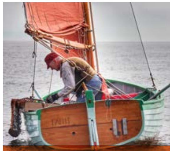
Hard at it , by Stacey Belbin.